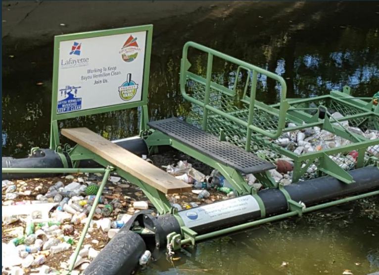
Bandalong Litter Trap