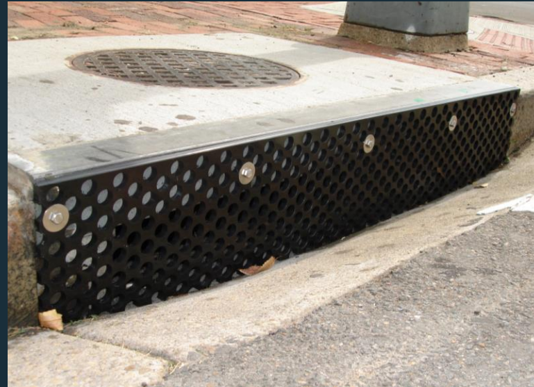
Curb Inlet Protector